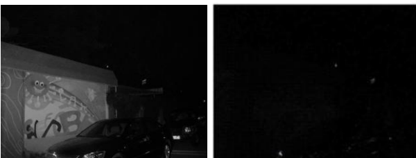
With IR light