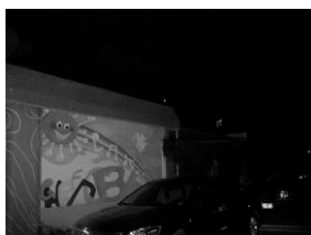
With IR light