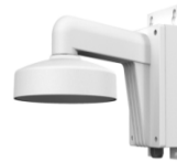
Wall mount + Junction Box