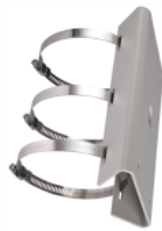
DS-1275ZI-SUS Vertical Pole Mount