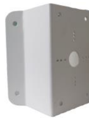
DS-1276ZI-SUS Corner Mount