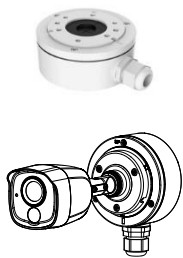
DS-1280ZI-XS Junction Box