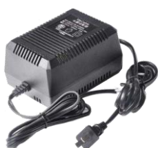
TEAC-66-243000V (EU) MKAC-66-243000U (USA) TEAC-66-243000VB (UK) Power adapter