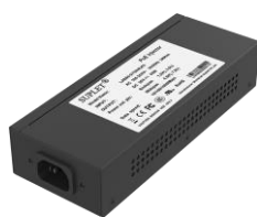
LAS60-57CN-RJ45 Hi-PoE Midspan