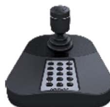
DS-1005KI USB Joy-stick