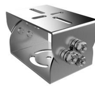
DS-1706ZJ PT joint