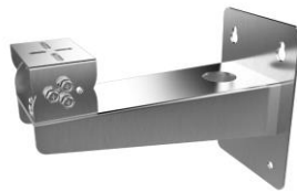
DS-1704ZJ Wall mount