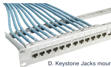
D. Keystone Jacks mounted in chrome style patch panel, Part No 100-028