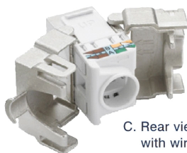
C. Rear view of Keystone with wire cap attached