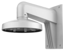
DS-1473ZJ-155-Y Wall Mount