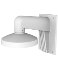
DS-1473ZJ-155 Wall Mount