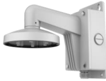
DS-1473ZJ-155B Wall Mount