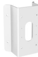
DS-1476ZJ-Y Corner Mount