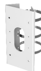
DS-1475ZJ-Y Vertical Pole Mount