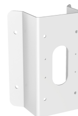
DS-1476ZJ-SUS Corner Mount