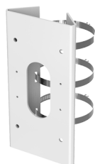
DS-1475ZJ-SUS Vertical Pole Mount