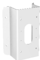
DS-1476ZJ-Y Corner Mount