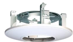
DS-1227ZJ In-Ceiling Mount