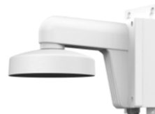
DS-1273ZJ-130B Wall Mount