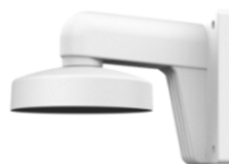
DS-1273ZJ-130 Wall Mount