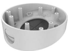
DS-1281ZJ-DM23 Inclined Ceiling Mount