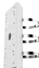
DS-1275ZJ-SUS Vertical Pole Mount